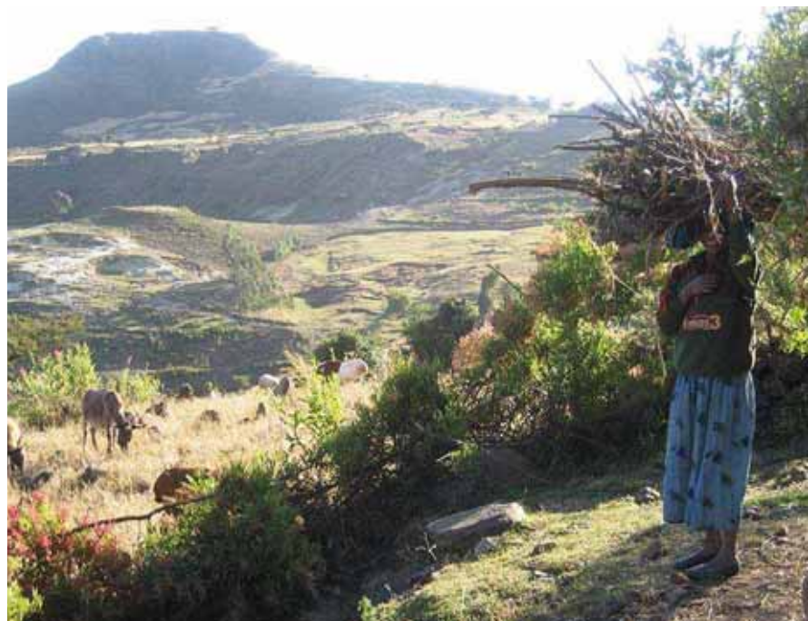
Will she inherit a fair share of her husband's farm if he dies or divorces her? The new land laws give her the right to, while traditions do not.