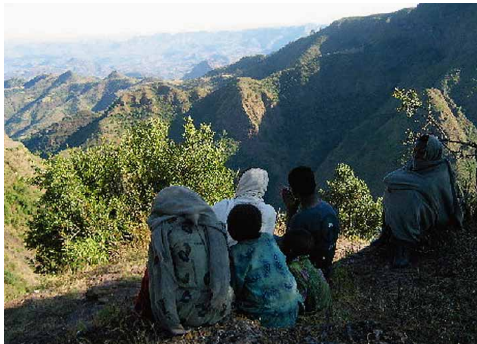
For this family the rugged land is their life. Ethiopia's land reform will have an impact on their future livelihood.

This study focuses on how the land law has been implemented in practice. In particular, the study examines how the position of women, in cases of divorce or death of the husband, may have changed and whether the new laws have impacts on the empowerment of women. However, as the study focuses on early impacts of the process, it is unrealistic to expect large changes in the amended roles and improved rights of women. Gender impacts are also captured by comparing the situation of female-headed households with other households.