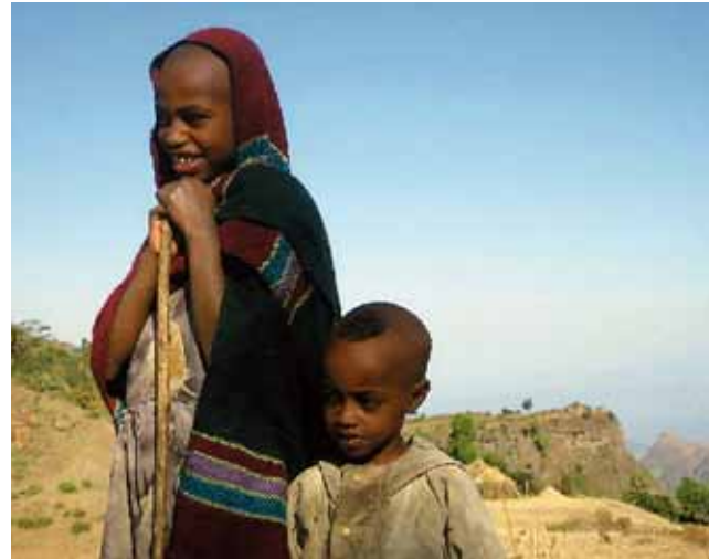
Do the changing land laws mean more secure land rights for young Ethiopian women?

One example found in one study area illustrates some of the problems. When one wife's husband died,