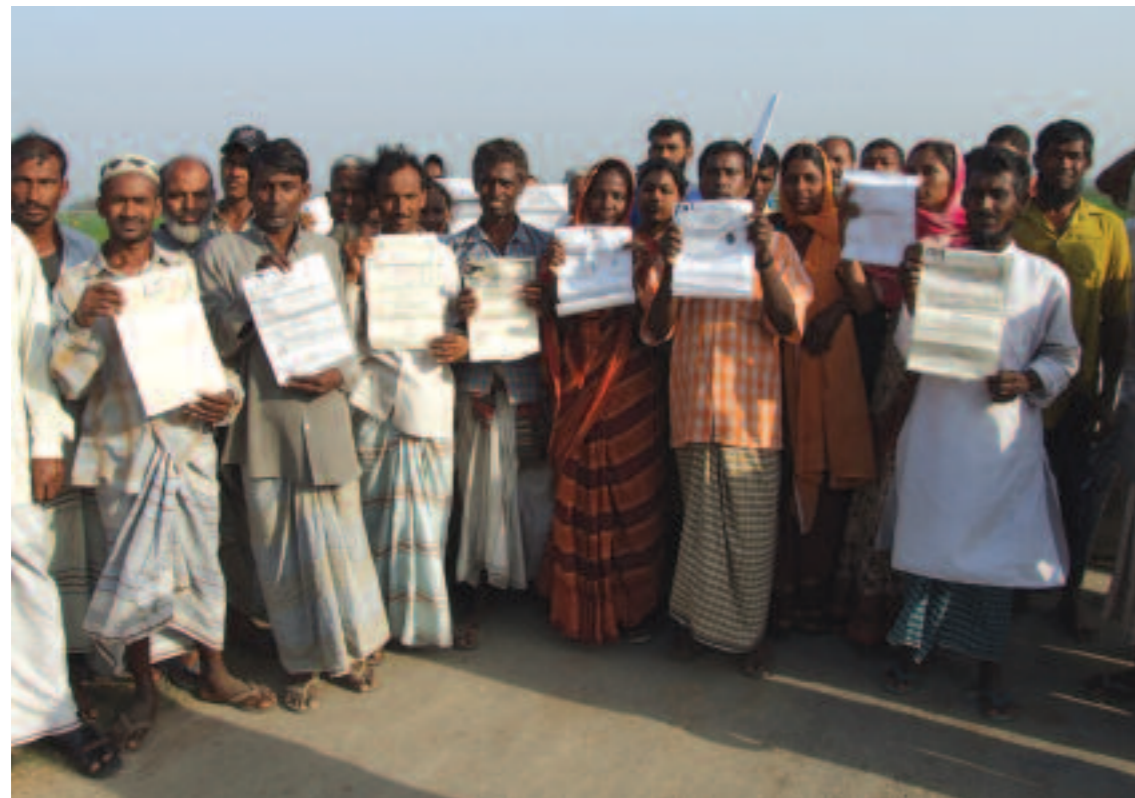
Former landless people proudly display their new title deeds in Bangladesh, thanks to the SAMATA programme which receives funding from DFID