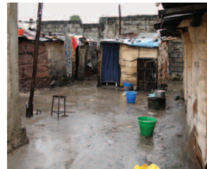
Slum area of Kinshasa in the Democratic Republic of Congo

Population densities, land values and competition over land rights are much higher than in rural areas – increasing the potential for disputes and heightening the risk of conflict. In this context, people may need the enhanced security offered by a formal individual title, in order to establish clear rights to land and property. Nevertheless, in