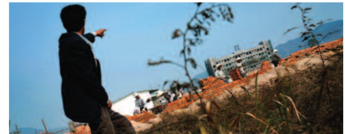
In China, a man points to the land where his village was taken over for new construction activity.

The main political challenge is that the more unequal the distribution of land, the more difficult it is to achieve reform. As a result, this diminishes the incentive for governments to try to achieve change. Unequal distribution of land is often strongly linked with broader inequalities, such as those based on ethnicity – potentially explosive issues which politicians may be unwilling to tackle.