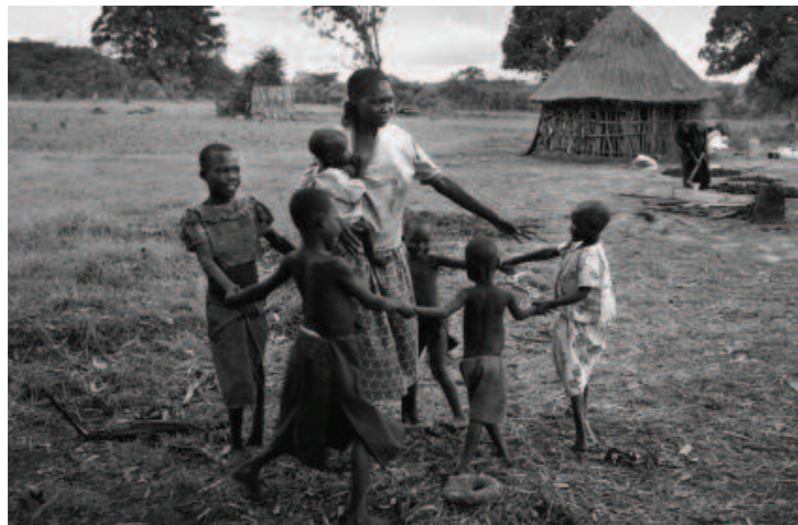
Secure rights to land and property give poor people some basic assets that they can use to improve their lives.

DFID recognises the importance played by secure rights to land and property in reducing poverty and encouraging equality. We are committed to supporting poor countries' efforts to help poor people to gain fair access to land, without which they will not be able to build their livelihoods and secure a better life for their families and communities.