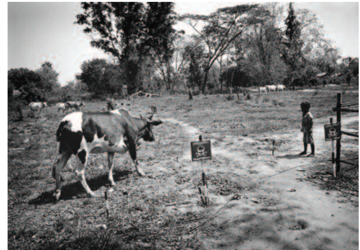
Despite the signs warning of unexploded land mines, people in Cambodia risk serious injury and death to themselves and their livestock in order to make a living.

All of these approaches involve more than mere money and administrative capacity, they require significant political will. There are few quick wins in improving access to land and securing tenure, and this is particularly true in post-conflict situations. It is always difficult to judge exactly how much can or should be done. And the stakes are very high, because reforms can significantly shape a country's future social and economic structures.