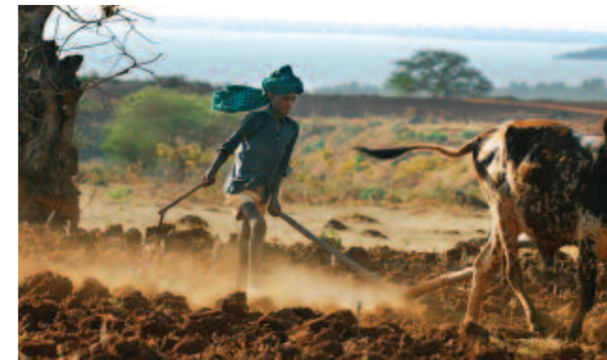
Proper land registration means that poor farmers in Ethiopia have more confidence to invest in their land without fear of eviction.

Recognising that action on land is good for economic growth and poverty reduction, countries like Rwanda are, with support from DFID, giving land renewed emphasis in poverty reduction strategies.