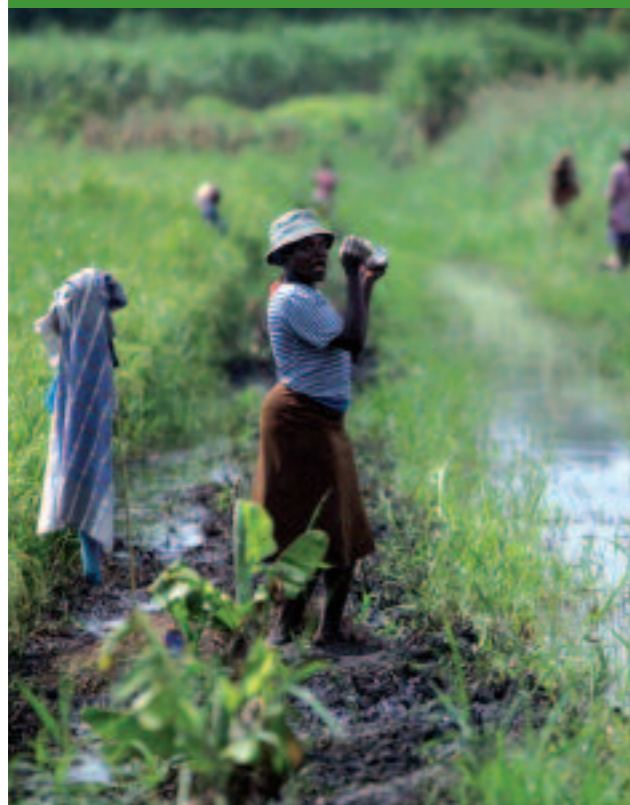
Scaring birds from the fields in Mozambique, where DFID is helping to improve people's awareness of the rights offered by the recent Land Law.

New land legislation in Mozambique recognises customary rights and women's individual rights to land. It also emphasises the importance of community consultation and agreement by those applying for or investing in land use. But despite the efforts of the government and civil society to spread the message, community awareness of their rights under the Land Law is still very weak