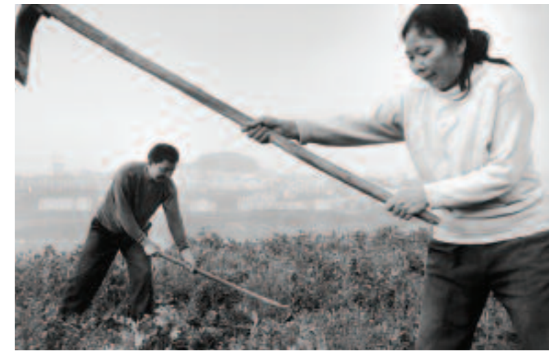
Women are the mainstay of farming in developing countries, but gender discrimination prevents many from owning or inheriting the land that they farm.

Certain groups remain particularly disadvantaged – for example on the basis of ethnicity, tribe or gender. In many countries, culture, tradition and formal legislation really stack the odds against women. Rural women produce 60-80% of the food in most developing countries, but in India, Nepal and Thailand, fewer than 10% of women farmers own land. Even where laws governing tenure and inheritance are more progressive, many women are still discriminated against due to lack of awareness or resistance to change ( Box 7 ). The story of Maria (p.2) illustrates how land may be registered in the name of men only, regardless of who is using it. Widowed women may be thrown off the land in favour of male relatives, and single mothers may find it hard to get a land title. We must work to ensure that women are given the same options as men.