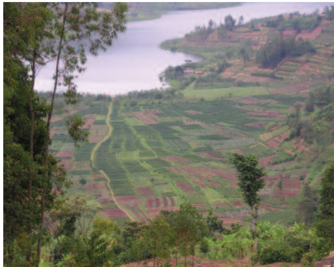
Agricultural land in Rwanda, where DFID is supporting land reforms