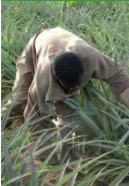
Clearer and more secure land rights will help to avoid disputes over land held under traditional systems in Ghana

In many African countries, ‘official’ state land laws co-exist with a diverse range of traditional systems and this makes land a complex and divisive issue. Ghana is a case in point, where access to 80% of land is controlled by a range of traditional tenure systems. There are some 60,000 unresolved court cases over land disputes. Problems associated with land rights are seen as the key obstacle to poverty reduction, private sector development and growth, and a major source of conflict.