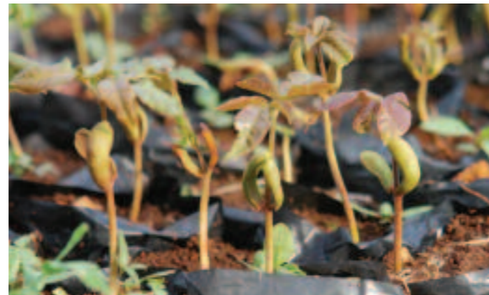
New seedlings in Indonesia, where DFID has helped to strengthen land rights and give farmers the confidence to make productive and sustainable investments in their land.

As well as attracting external investment, secure tenure encourages local people to make productive investments in agricultural land, businesses, homes and neighbourhoods. Few people will take the risk of investing savings and improving