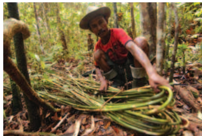
In Indonesia, DFID helps to secure community rights to gather forest products and manage the forest more sustainably.

grants have been used to help resolve land-use conflicts, to teach farmers marketing skills and to strengthen the role of the media in promoting good governance. Corruption has been exposed, markets are opening, local government regulations are being reformed and old mindsets are changing 22 .