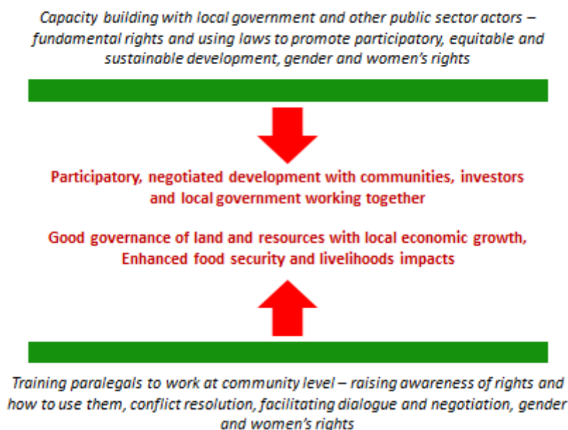
Figure One – the ‘Twin Track’ approach

The methodology of attaching two sides of the empowerment and development challenge has become known as ‘twin-track’ approach. Legal empowerment of communities on one side is matched by measures to improve the way that local governance structures interact with communities on the other. The result is a process of sustainable and equitable development where the key role of the District Government in the community consultation process is far more constructive and uses the available legal instruments to promote a more equitable and consensual model of agrarian investment (Figure One).