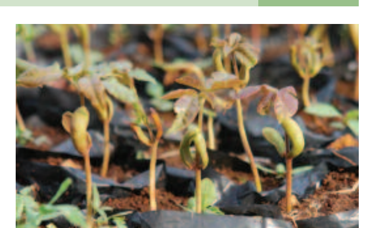
New seedlings in Indonesia, where DFID has helped to strengthen land rights and give farmers the confidence to make productive and sustainable investments in their land.

neighbourhoods. Few people will take the risk of investing savings and improving