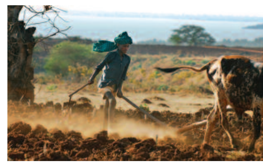
Proper land registration means that poor farmers in Ethiopia have more confidence to invest in their land without fear of eviction.

Evidence from other countries also shows that people are willing to pay local taxes, providing the amounts are affordable, and that