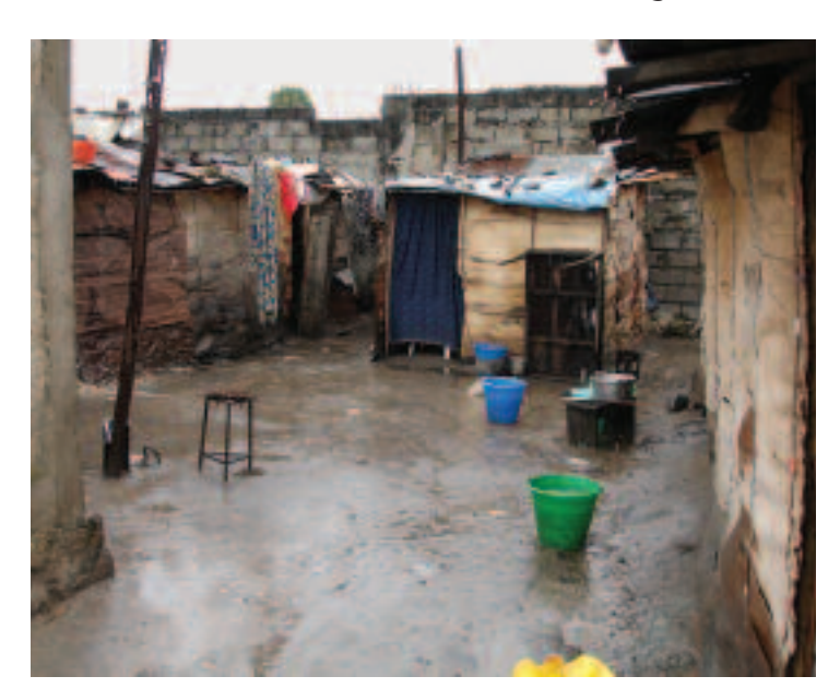
Slum area of Kinshasa in the Democratic Republic of Congo

Population densities, land values and competition over land rights are much higher than in rural areas – increasing the potential for disputes and heightening the risk of conflict. In this context, people may need the enhanced security offered by a formal individual title, in order to establish clear rights to land and property. Nevertheless, in