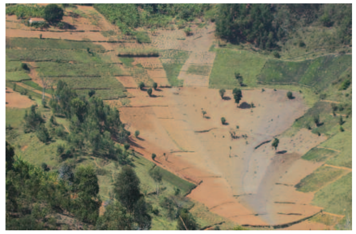
Slope erosion on agricultural land in Rwanda

Land policies are fundamental to sustainable growth " Nicholas Stern<sup>12</sup>