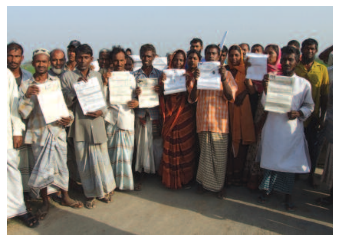
Former landless people proudly display their new title deeds in Bangladesh, thanks to the SAMATA programme which receives funding from DFID