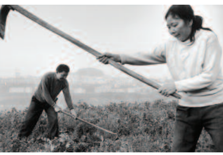
Women are the mainstay of farming in developing countries, but gender discrimination prevents many from owning or inheriting the land that they farm.

Certain groups remain particularly disadvantaged – for example on the basis of ethnicity, tribe or gender. In many countries, culture, tradition and formal legislation really stack the odds against women. Rural women produce 60-80% of the food in most developing countries, but in India, Nepal and Thailand, fewer than 10% of women farmers own land. Even where laws governing tenure and inheritance are more progressive, many women are still discriminated against due to lack of awareness or resistance to change (Box 7). The story of Maria