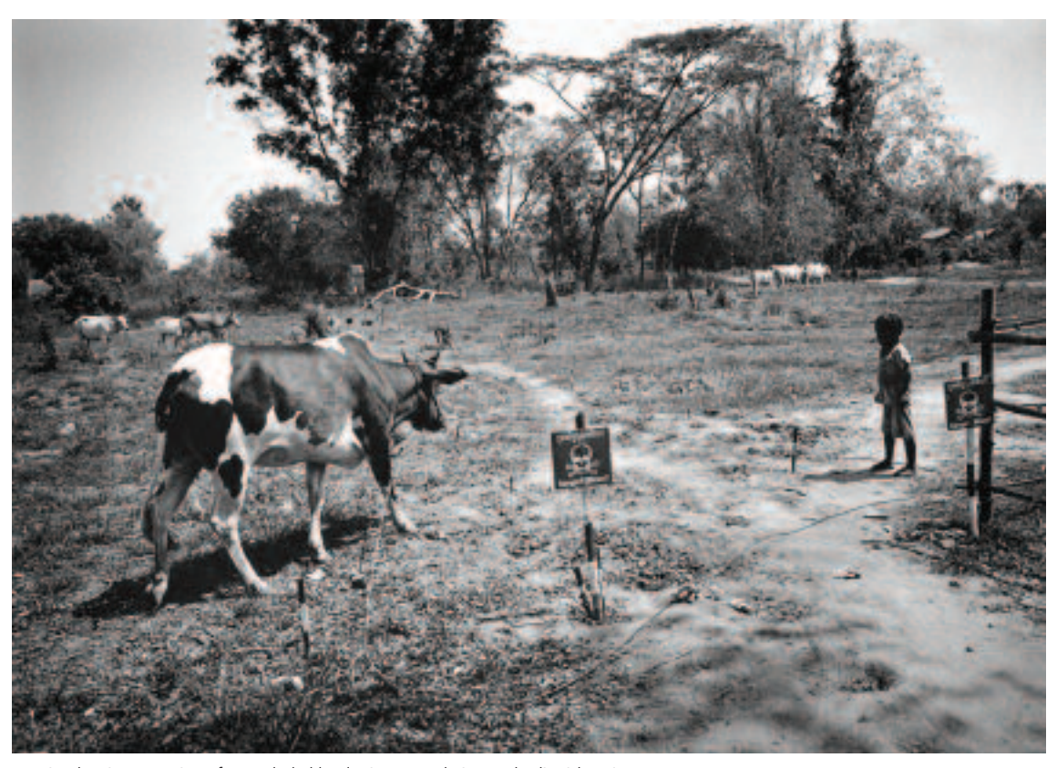
Despite the signs warning of unexploded land mines, people in Cambodia risk serious injury and death to themselves and their livestock in order to make a living.

All of these approaches involve more than mere money and administrative capacity, they require significant political will. There are few quick wins in improving access to land and securing tenure, and this is particularly true in post-conflict situations. It is always difficult to judge exactly how much can or should be done. And the stakes are very high, because reforms can significantly shape a country's future social and economic structures.