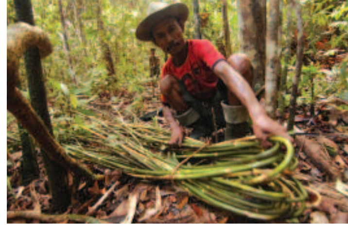
In Indonesia, DFID helps to secure community rights to gather forest products and manage the forest more sustainably.

In Indonesia, DFID is helping civil society to strengthen farmers' voices and encouraging local government to respond. Helping poor people to access unused and deteriorating state land for agro-forestry activities reverses both poverty and environmental decline (Box 10). Mapping traditional territories has helped to clarify access rights and prevent illegal use of community forest land. But the initiative is about more than trees. Some 560