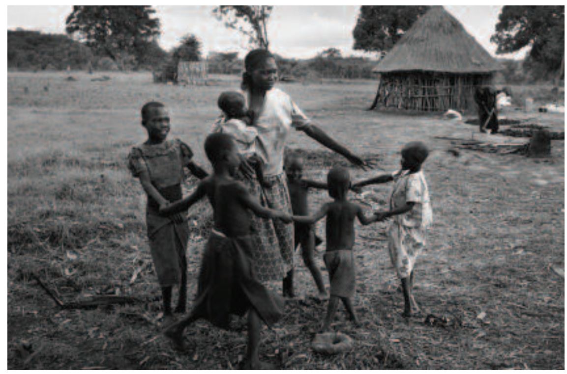
Secure rights to land and property give poor people some basic assets that they can use to improve their lives.

DFID recognises the importance played by secure rights to land and property in reducing poverty and encouraging equality. We are committed to supporting poor countries' efforts to help poor people to gain fair access to land, without which they will not be able to build their livelihoods and secure a better life for their families and communities.