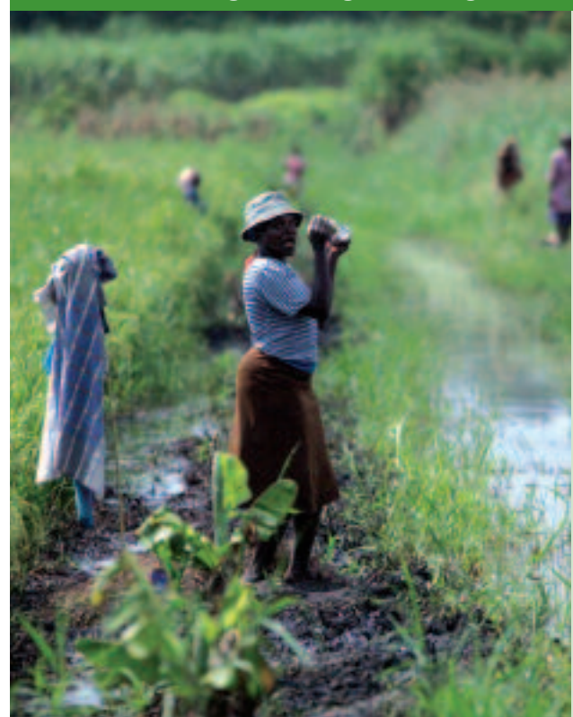
Scaring birds from the fields in Mozambique, where DFID is helping to improve people's awareness of the rights offered by the recent Land Law.

New land legislation in Mozambique recognises customary rights and women's individual rights to land. It also emphasises the importance of community consultation and agreement by those applying for or investing in land use. But despite the efforts of the government and civil society to spread the message, community awareness of their rights under the Land Law is still very weak